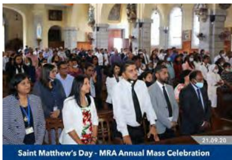
Saint Matthew's Day - MRA Annual Mass Celebration

The St Mathews Mass is a yearly feature which the MRA family celebrates with a lot of enthusiasm.