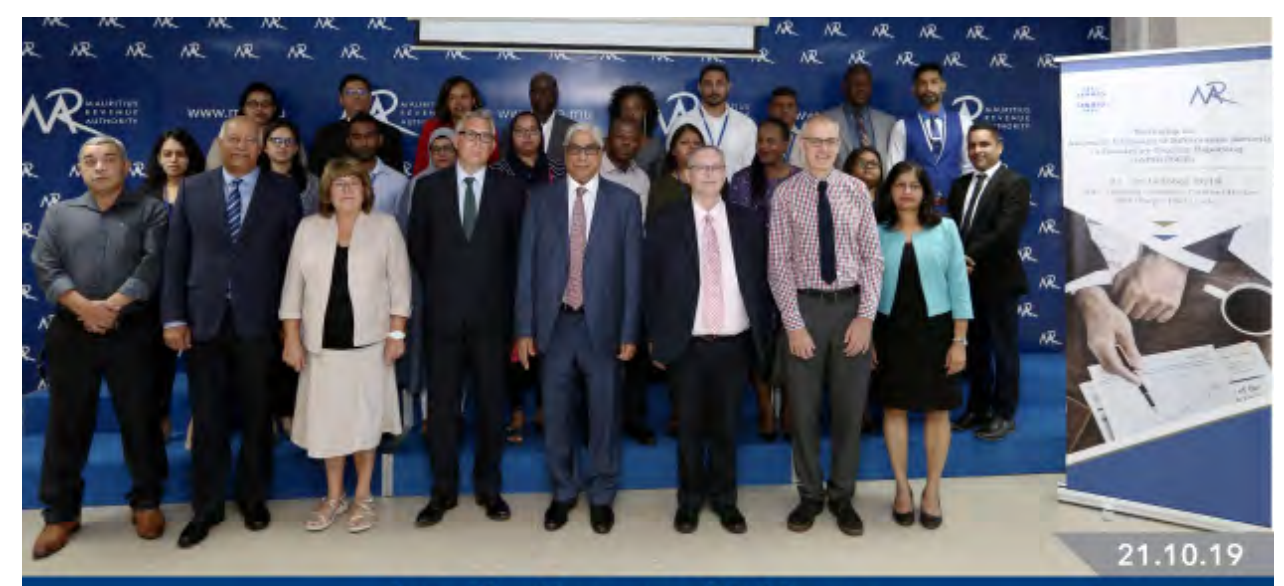
Launching Ceremony - Workshop on Automatic Exchange of Information Security in Country by Country Reporting (AEOI CbCR)

Since the MRA has been able to successfully implement the AEOI, the CATA has proposed that the MRA share its expertise with jurisdictions which are in the process of implementation. Only two African countries, namely Mauritius and South Africa, have already exchanged information under the Common Reporting Standard (CRS), as they are the only countries having a suitable infrastructure to deal with AEOI.