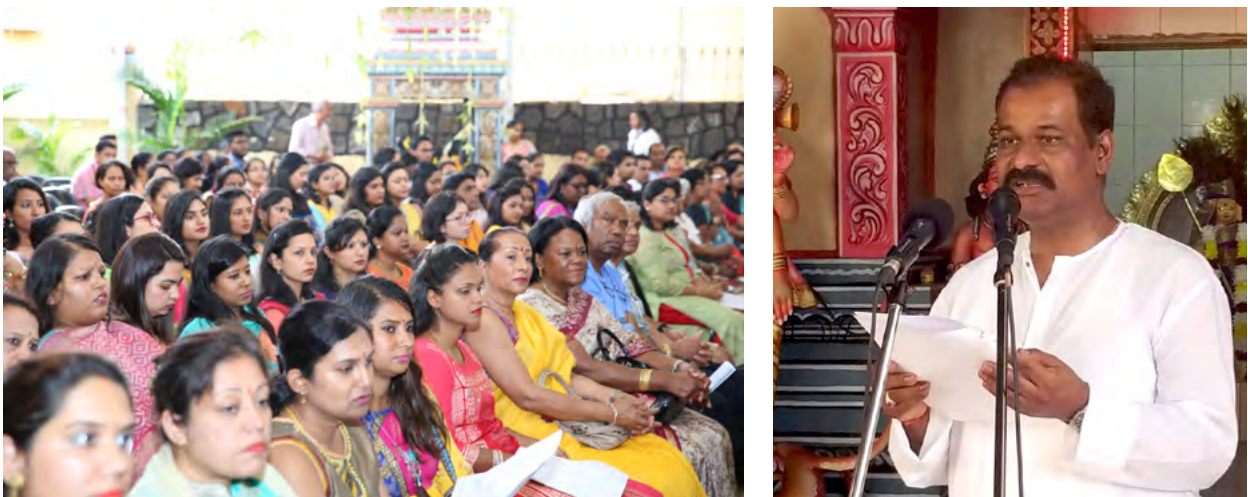
The event ended with an Aarti followed by a Maha Prasadam.