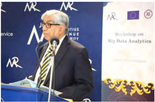
Mr. Lal concluded that the MRA is committed to enhance border protection, in line with Government's policy.