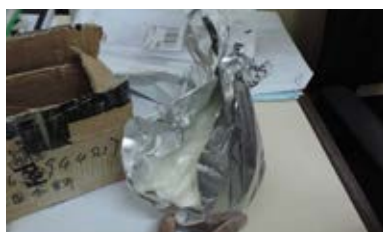
Seizure of 2kg of synthetic drugs

One of the goals of the MRA is to reinforce the Mauritian border protection and, to that end, the MRA Customs Department made four major seizures of synthetic drugs amounting to Rs. 43 million since November 2017.