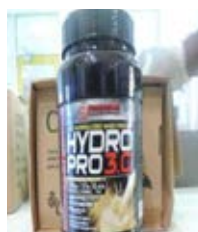
Seizure of 2.55kg of synthetic drugs concealed in a plastic container of Protein Supplement

The MRA reiterates its appeal to the public to report suspected drug cases anonymously through the MRA Stop Drug Platform on www.mra.mu or by calling on the Hotline 8958 .