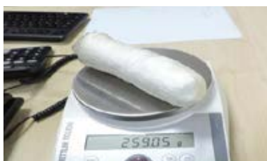
259g of heroin concealed in the private parts of a female Malagasy passenger