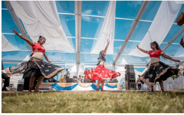
Following the protocol, the Cassiya and Bhojpuri Boys groups performed live musical items and the dance floor opened at around 15h00.