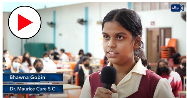
Today's youth are tomorrow's taxpayers

Taxpayers who have not yet done so, may subscribe to the MRA Taxpayer Mailing List through the MRA website: www.mra.mu to receive notifications concerning new developments.