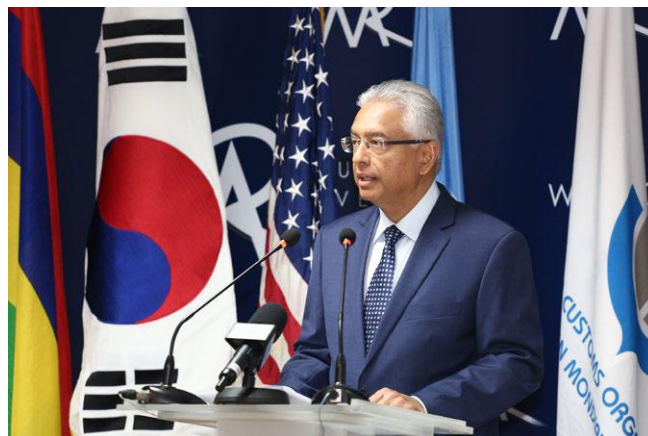
Hon. Pravind Kumar Jugnauth, Prime Minister

In his keynote address, Hon. Pravind Kumar Jugnauth, emphasized that “the government is leaving no stone unturned to assist enforcement authorities to fight drug trafficking in our country” . This training, according to him, comes at an opportune moment, as building the capacity of the enforcement officers goes hand in hand with massive investment in tools and technology for use by the Police and MRA.