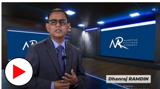
e-Invoicing: Le nouveau projet phare de la MRA