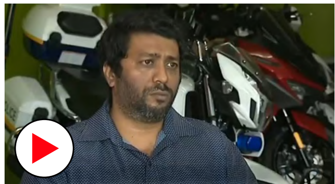
Une synthèse du 'Prime à L'Emploi'