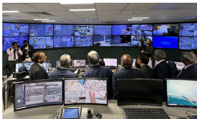
The Port Surveillance Command Centre inaugurated at the Custom House